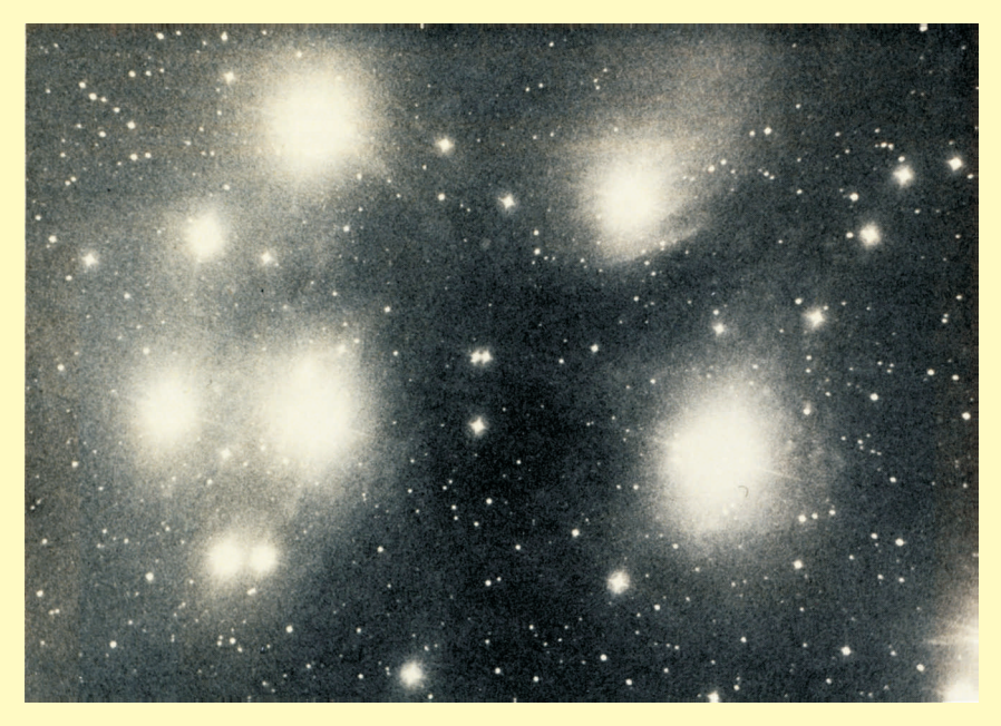
Jack Newton used a 25-minute exposure on Tri-X film to obtain this view of the Pleiades. The photograph was taken on October 26, 1976 from his new observatory, using his 12.5-inch telescope.

glued to form the arches and the circle for the dome and the top of the wall. A 10-foot circle was chalked out on the driveway to aid in the construction. Masonite was used to cover the two halves of the dome. The floor was made of hand-mixed concrete four inches thick. Twelve bolts were sunk around the edge of the wet concrete floor. Later, the walls were attached to these bolts.