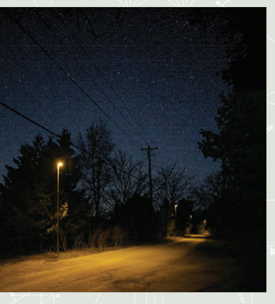
Pole-mounted low-impact lighting along a rural road. "Low impact" does not necessarily mean dim. However, spectrum, brightness, shielding and uniformity must be well defined. Photos and chart: Robert Dick