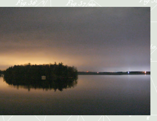
The increasing use of white-light luminaires (at right) in towns and cities is beginning to change the nature of urban sky glow.