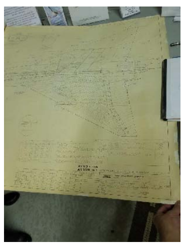
and many more.