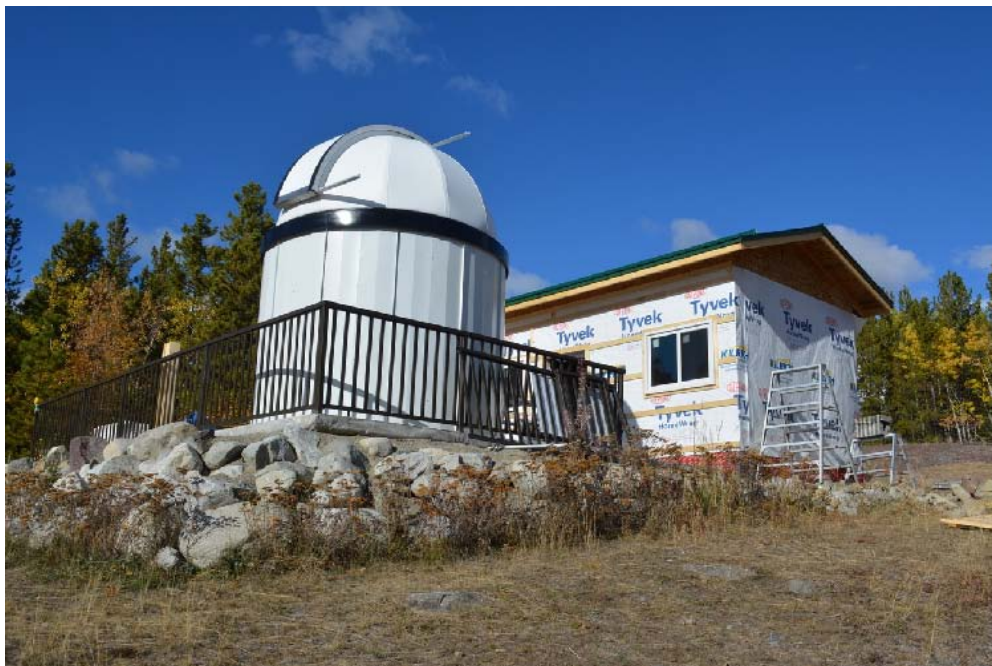
Figure 1: The Yukon Centre's observatory in Takhini Spring nearing completion.

Back in September 2016 members of the Yukon Astronomical Society stood on a hillside with me in Takhini Springs, south of Whitehorse, and told me how they intended to build an observatory there. Two years less three weeks later it gave me great pleasure to stand in that same spot to see them open that observatory.