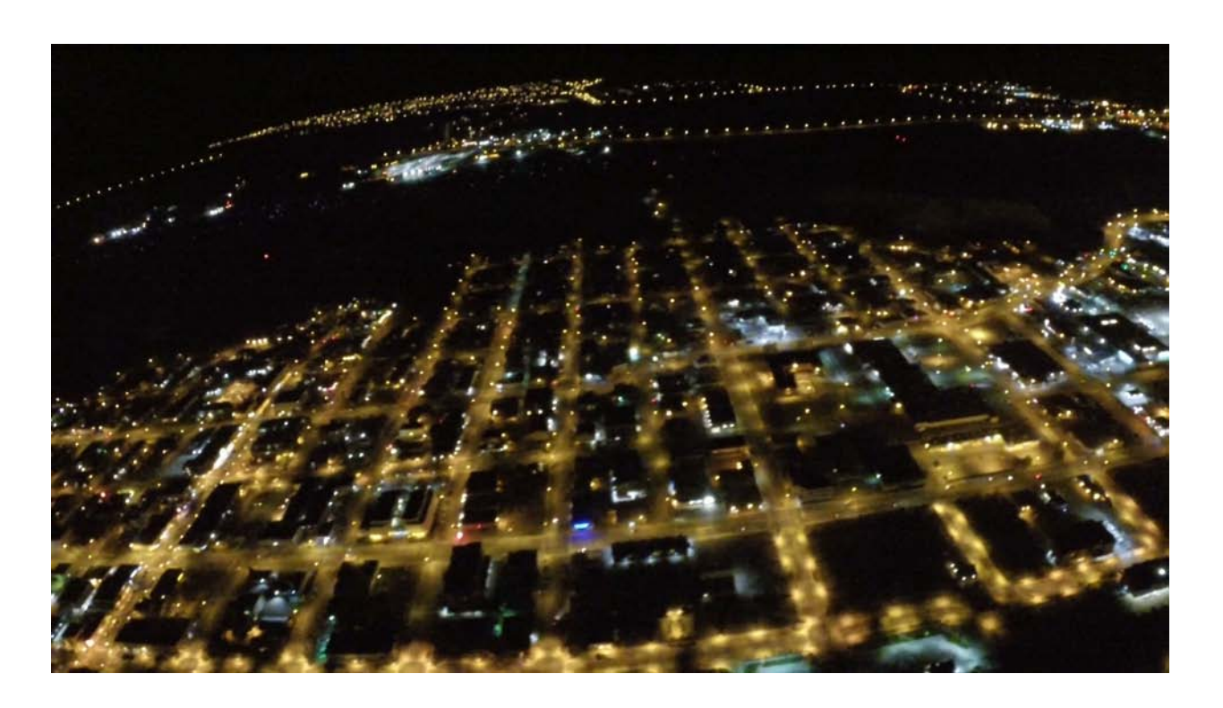
Figure 2 Downtown Whitehorse

Currently, the RASC: Yukon Centre - Yukon Astronomical Society is studying levels of light pollution in the City of Whitehorse, Yukon. Our Light Pollution Abatement Program has succeeded in convincing our utility, ATCO Electric Yukon, in exceeding HSE regulatory requirements by installing new 3000K LED streetlights which are International Dark-Sky Association (IDA) approved. The Society is also scheduled to give formal presentations to the City Councils of Whitehorse and Haines Junction on the impacts of Light Pollution in early 2017.