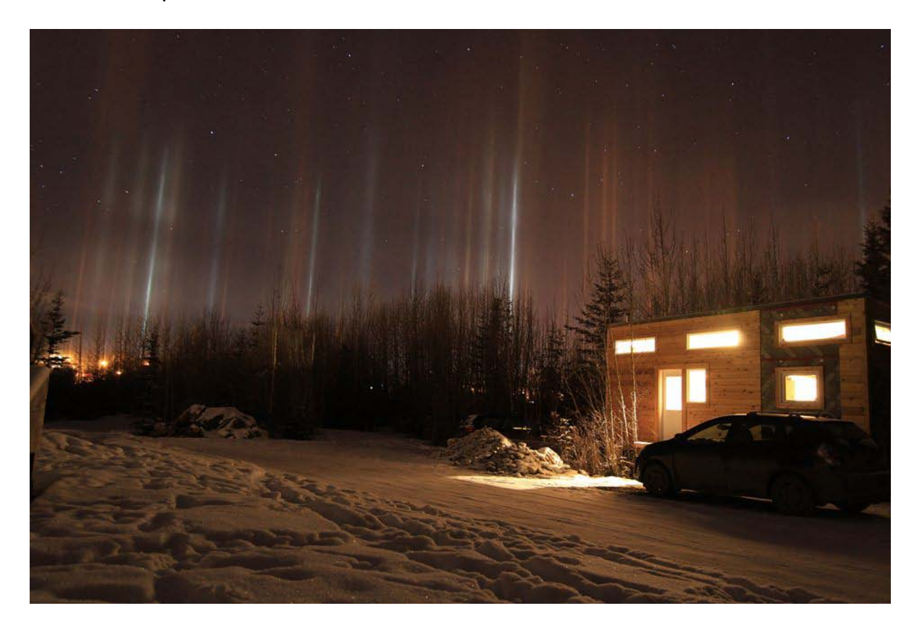
Figure 1 Light Pillars (Whitehorse, Yukon)

The different colours in the picture labelled Light Pillars (Figure 1), come from the various colour temperatures of our street lights. The warm orange ones come from traditional high pressure sodium lamps whereas the bright white pillars come from new LED lamps and metal halide bulbs.