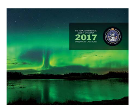
Observer's Calendar 2017