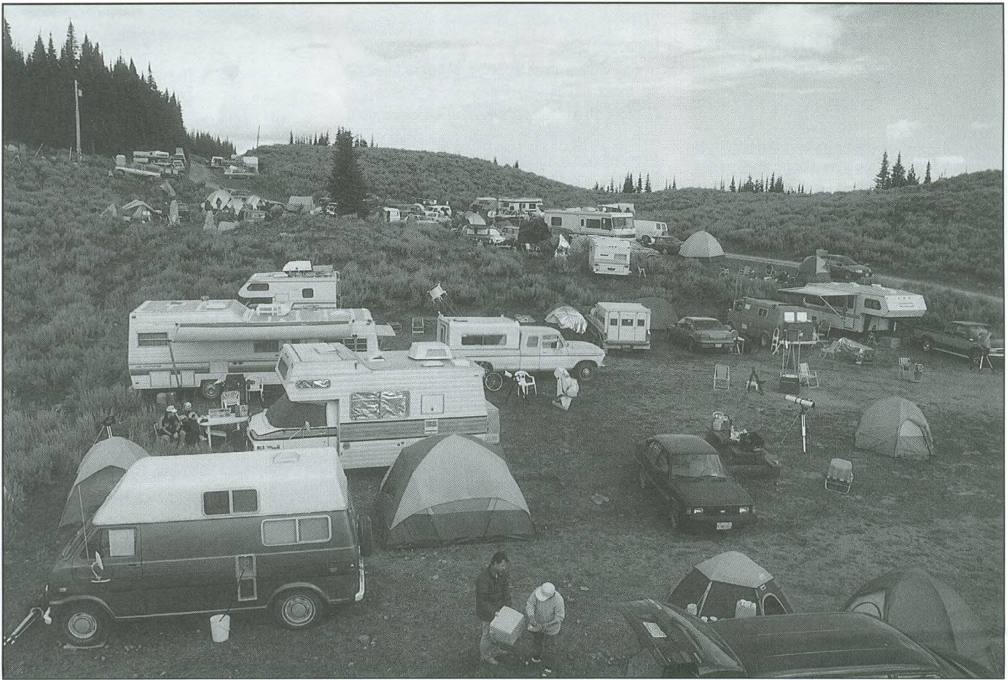
A view of the main observing site at the 1995 Mount Kobau Star Party.

that most of the rest of us had degenerated into crude, unkempt mountainmen.