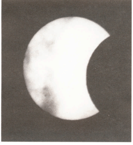
The annular eclipse at its best (at least from Canada!) Photo taken from Victoria, British Columbia by Chris Spratt.

Of course access to the observing site, in winter, was a necessity and the apparent change in our weather that autumn – rain (hallelujah!), and snow at higher elevations – focused the need for a variety of observing sites. In addition, I expected to bring my family along so reasonable roads were a necessity. I spent the eight weeks prior to the eclipse scouring southern California for observing sites up and down the coast and inland. Eventually I had a collection of sites ranging from an ocean view in the mountains above Topanga Canyon near the north limit and inside the geometric path, to seaside and inland sites in southern San Diego County including Palomar Mountain, beyond the path's