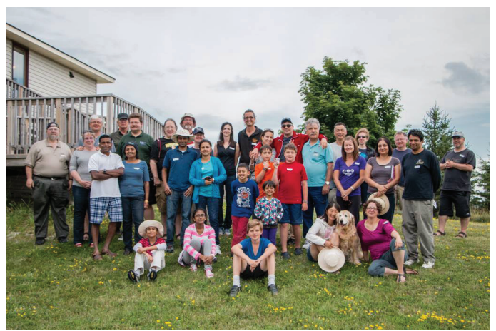
Carr Astronomical Observatory Star-B-Que-photo by Doug Isherwood