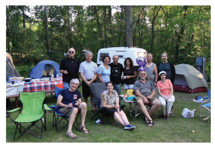
Winnipeg Centre Public Event 2014

The Winnipeg Centre participates in numerous regular astronomy events; some where we provide viewing opportunities for the General Public. One such event is the "Astronomy Night," held in March for the members of Fort Whyte Alive, a regional conservatory agency. It features our members providing presentations during a