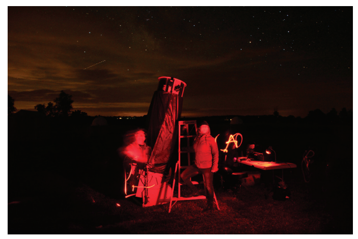
CAO Star-B-Que

annually to the Toronto Centre. $1600 in annual income also comes from the lease of the surplus CAO acreage to a local farmer. Income from the sale of annual CAO passes and user fees exceeded $7400.