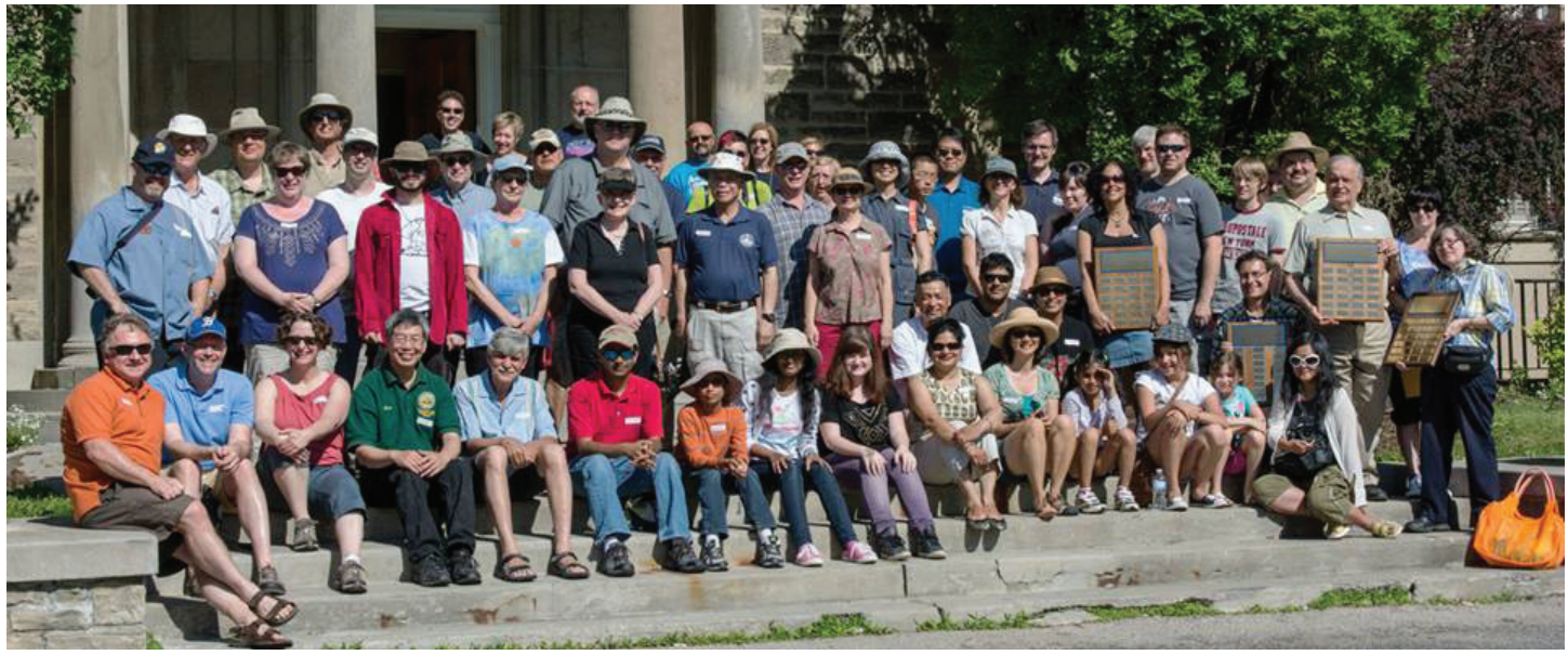
David Dunlap Observatory Awards Picnic

This summer we built five lockers inside the CAO garage for members to rent to store telescope equipment. The My Own Dome Lot project implemented in recent years, which allows members the privacy of their own dome with power and internet at the CAO currently has one of the six available sites available for lease. The five sites occupied by members bring in valuable income - $3960