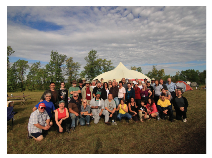
Winnipeg Centre SWSP Group 2014