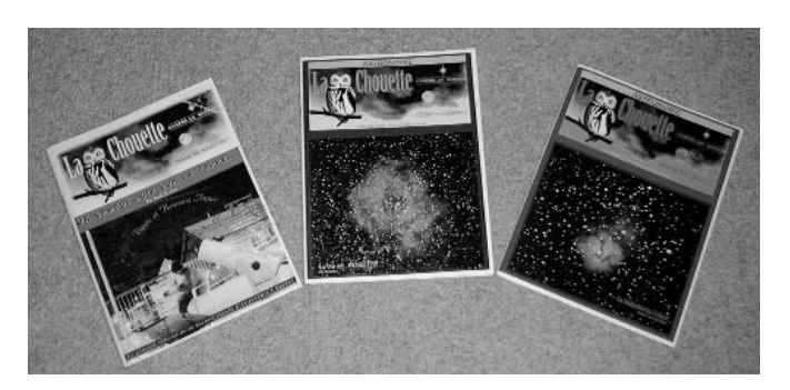
Voici la photo qui représente bien notre le Centre de Québec en 1999. Il s'ajit des 3 parutions de notre petite revue locale.

Bibliothèque: Jean Chiasson a réalisé l'achat de quelques nouveaux livres avec un petit budget de 100$. Un généreux