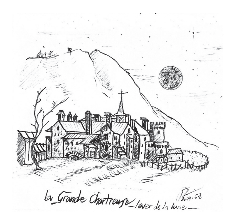
Figure 2 — Moon rise over the Grande Chartreuse, the mother house of Dom Bonaventure's order. It was remotely sited to give the monks some solitude. Carthusian houses could be located in urban areas, but the monks everywhere habitually led austere and mostly solitary lives. Miraculously, Dom Bonaventure avoided being intellectually isolated, or remote from the intellectual life of his contemporaries.

One of the most often-cited descriptions of the Republic of Letters in modern secondary literature is by the Carthusian monk Dom Bonaventure d'Argonne (1640–1704), an exact contemporary of Bayle's. Dom Bonaventure, like Bayle and Burney, had an interest in astronomy—he even collected telescopes at one time. His text is notable for its acknowledgment of the legitimacy of female participation in the common-