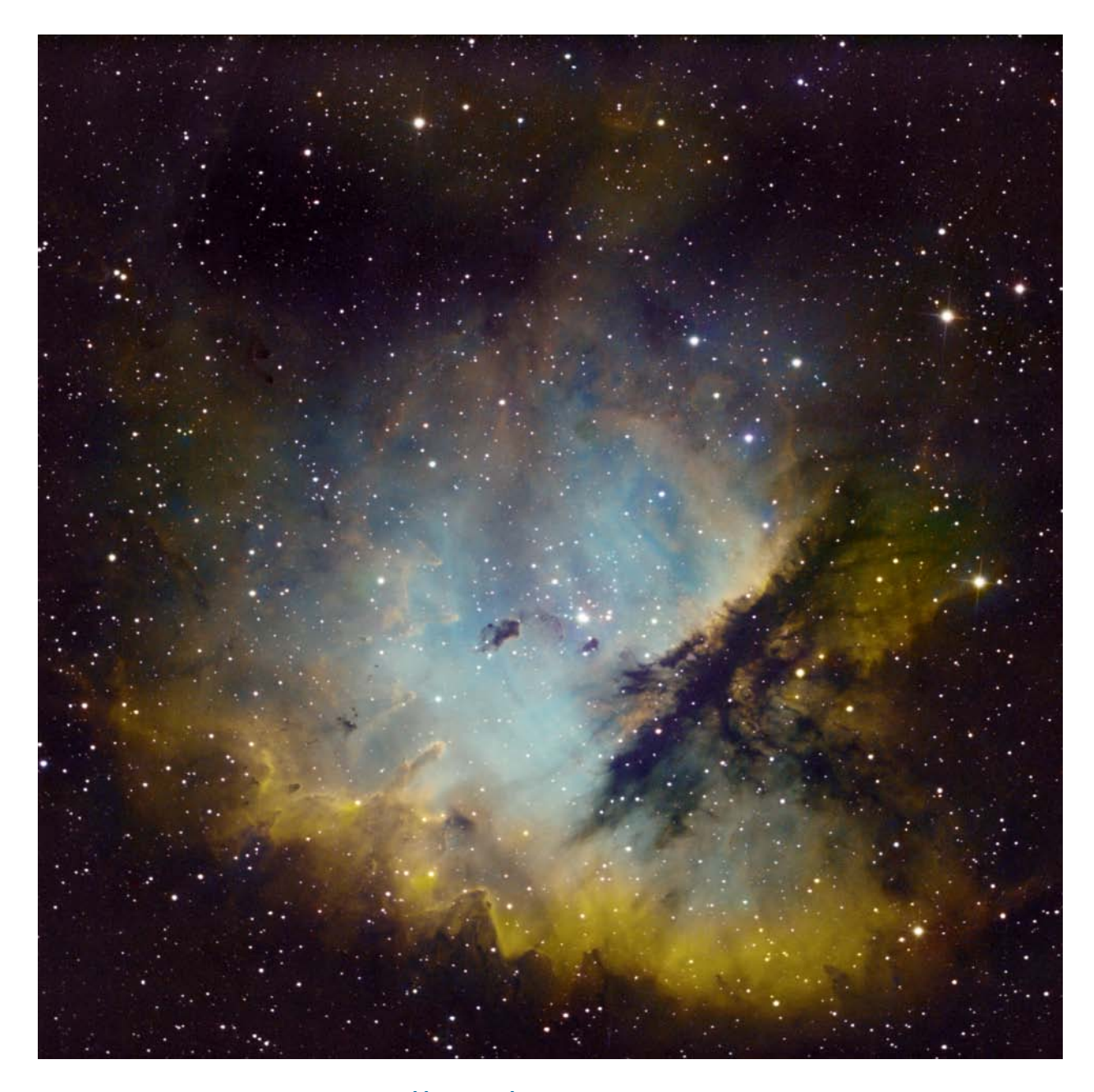
Pacman Nebula

200-mm lens. Some of the latest processed images taken with the telescope can be seen on <a href="https://rasc.ca/telescope-news">https://rasc.ca/telescope-news</a>