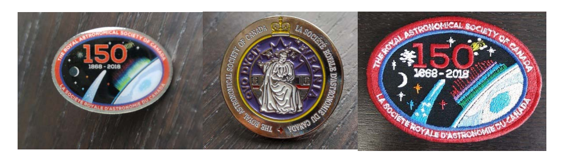
Only $19.95 or while supplies last. ($30 value)