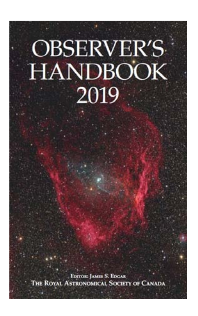
Observer's Handbook 2019 Editor: James Edgar

A beautiful calendar showcasing RASC members' astro-images with information on what's up in the sky tonight. A perfect gift for the beginner and a must-have for the experienced observer. IN STOCK. Available for order!