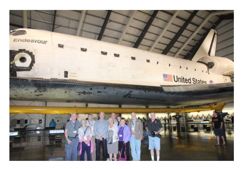
The Endeavour Space Shuttle.

What's next? Already being offered is the RASC's National Solar Eclipse expedition in August 2017. Hotels and camp grounds are quickly filling up along the eclipse path – why not bring the family on this amazing trip of a lifetime? – witness over 2 minutes of totality in the Grand Teton National Park in Wyoming.