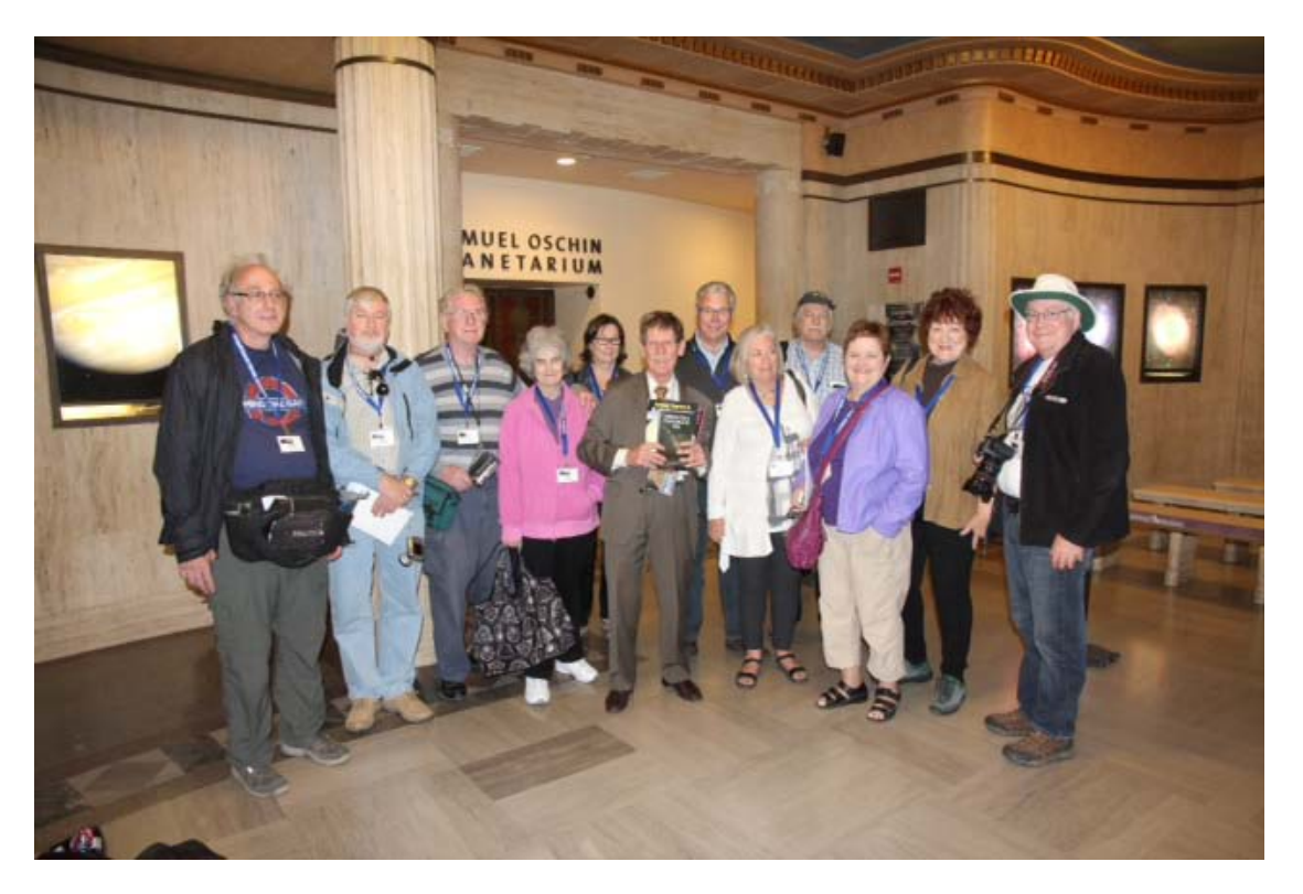
Griffith Observatory – we were greeted by Director Dr Edwin Krupp.

Center. There were also some non-astronomical visits – the group visited the Walt Disney Concert Hall, the Getty Art Museum and the Cathedral of Our Lady of Angels church– three examples of modern architecture. Also, one evening the group visited the Magic Castle for dinner – a mansion where guests can take in several shows performed by some of the world's best magicians and illusionists. A visit to Oceanside's telescope store – Oceanside Photo and Telescope – was a highlight for shoppers. We even fit in an unscheduled visit to the Roosevelt Hotel in Hollywood – the site of the first Academy Awards presentation in 1929.