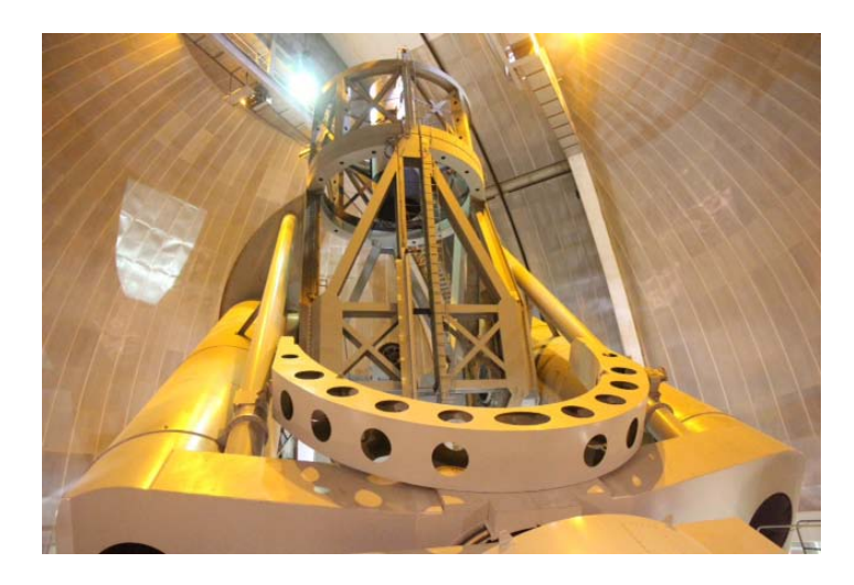
Mount Palomar – our view of the famous 200-inch Hale telescope