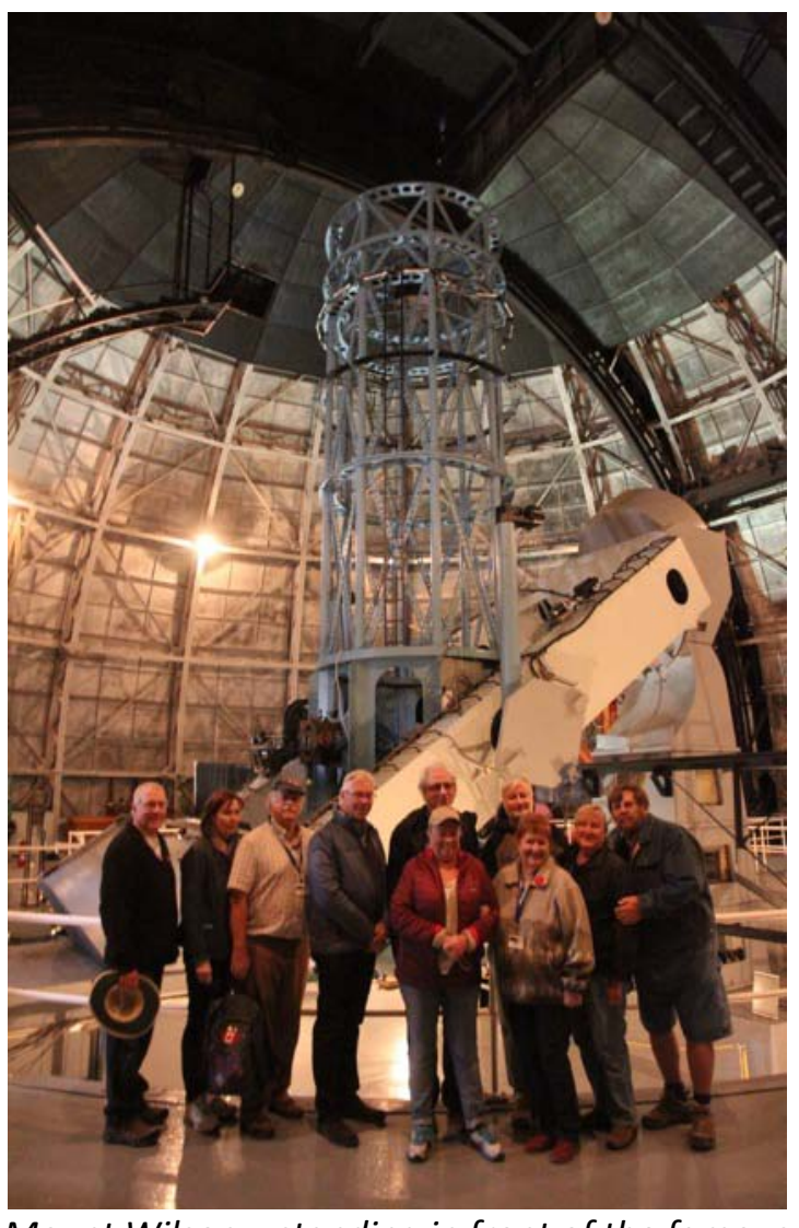
Mount Wilson – standing in front of the famous 100-inch Hooker Telescope.